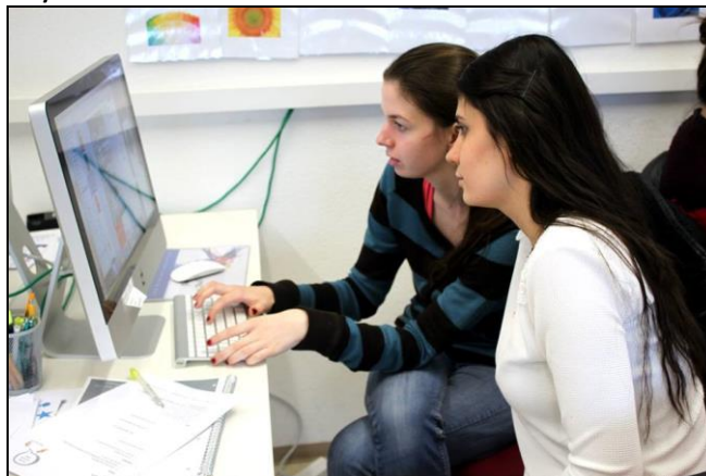
Volunteer and youngster working at the computer

We ask for your understanding: Only European Union or European Economic Area residents may apply. Due to project approval criteria, we can only accept volunteers in this placement who do not require a residence permit for 12 months in Austria. We ask you for your understanding for this project-related necessity.