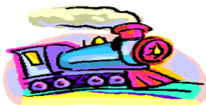
Limerick Junction Tipperary