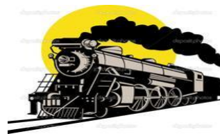
Heuston station Dublin